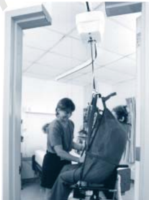
The cut-out above the door allows for continuous tracks in and out of a room.